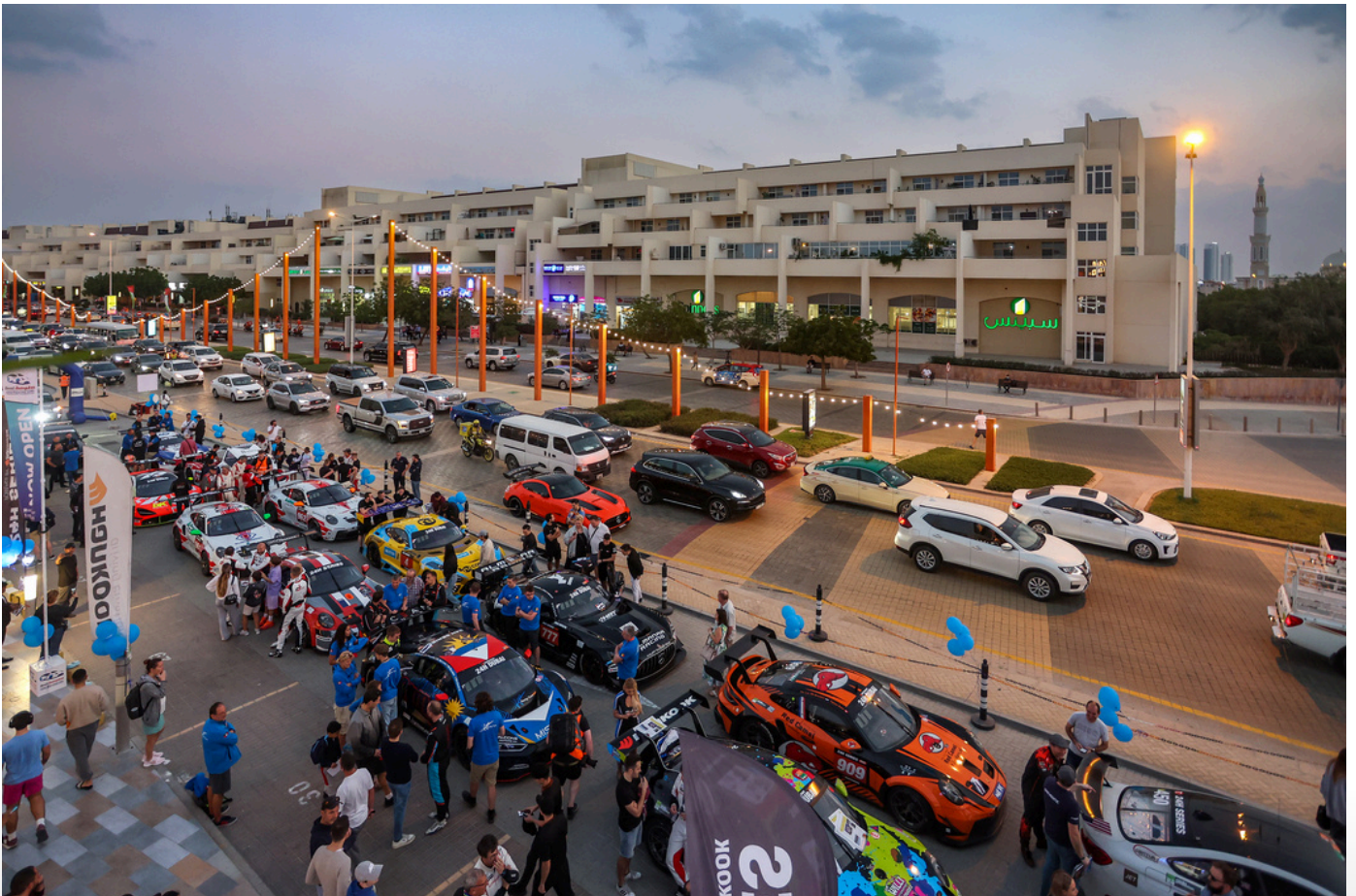
Parade to the Motorcity Mall